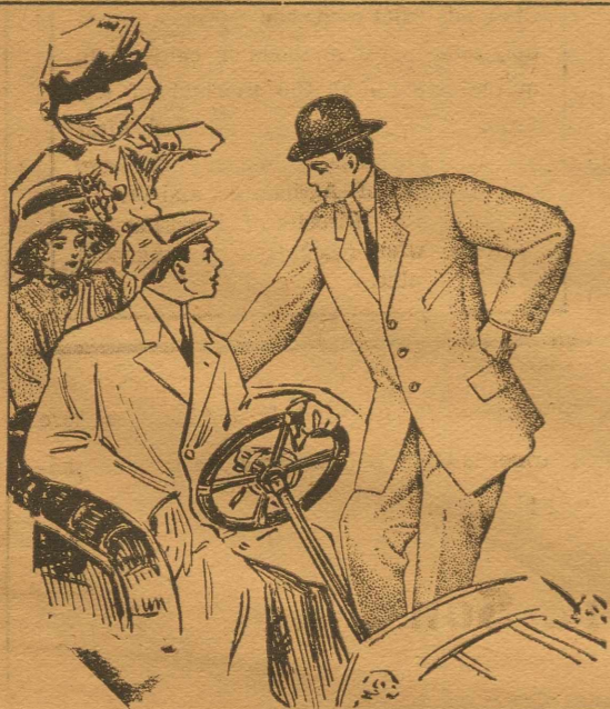
GOLDMAN BECKMAN & CO Good Clothes

We Have the Goods, Make the Prices, Have Experienced Salespeople, Show You New Goods and we want and will Appreciate your Trade. COME LOOK THROUGH. NO TROUBLE TO SHOW GOODS