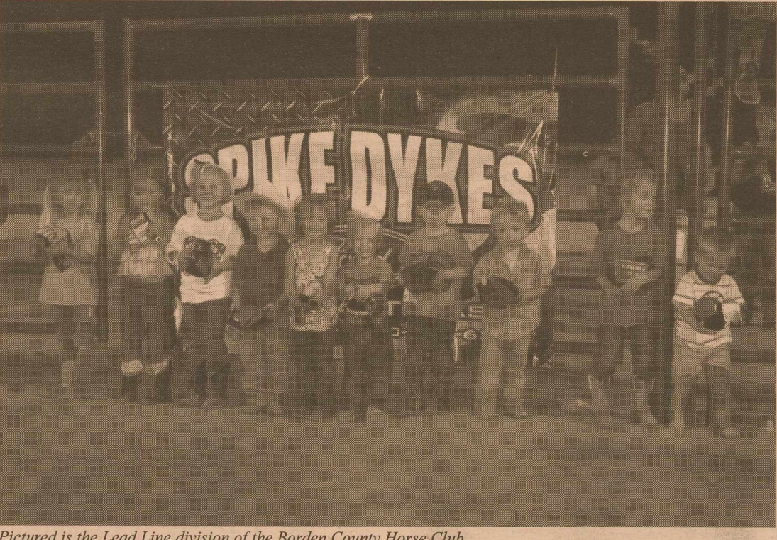
Pictured is the Lead Line division of the Borden County Horse Club.