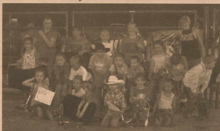
Last weeks meeting ended the Borden County Horse Club season, pictured above is the 5 and under through 13-18 divisions