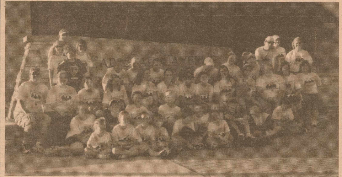
Borden County 4-H'ers enjoyed a trip to tour the Carlsbad Caverns this past Thursday. The Dawson and Garza 4-H clubs also attended.