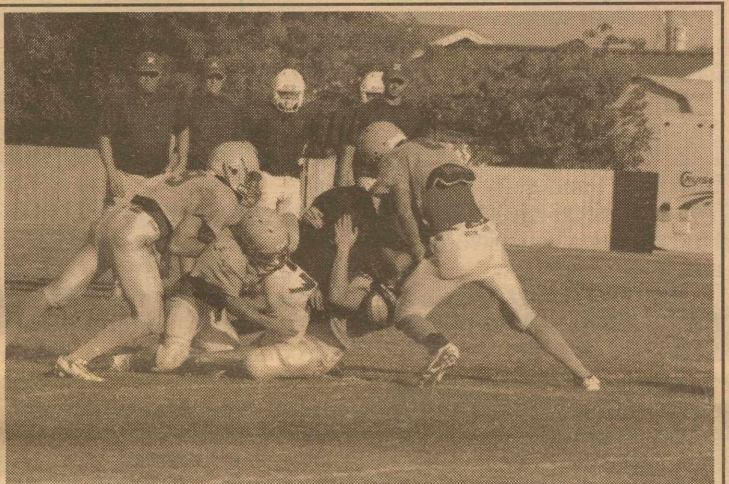
Covotes leave little room for a Cougar to advance to the goal line in Friday's scrimmage against the Klondike Cougars