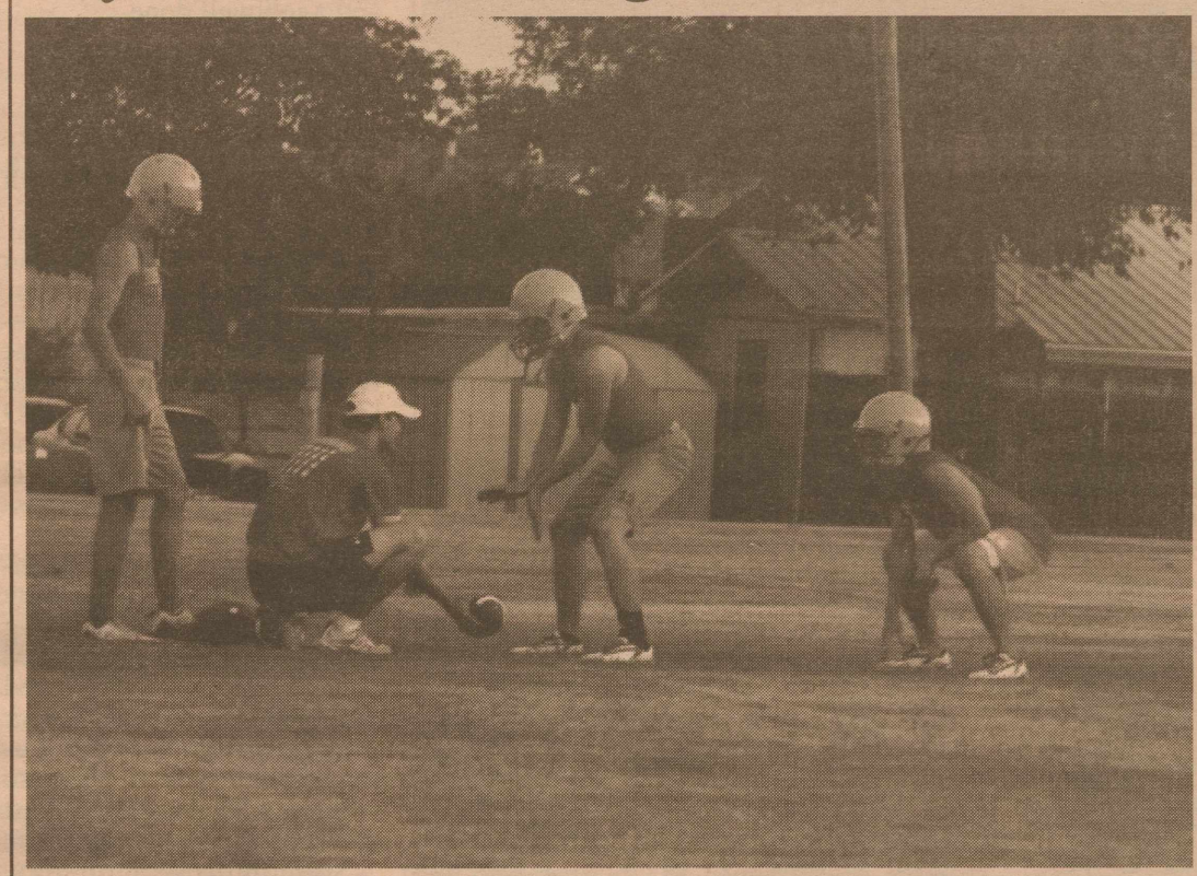
The Coyotes began workouts this past Monday in order to prepare for the upcoming football season. Coyote fans are hopeful for another successful year in light of last years state championship. The first scrimmage is scheduled for Saturday, August 15 against Loop and Ropes at Loop