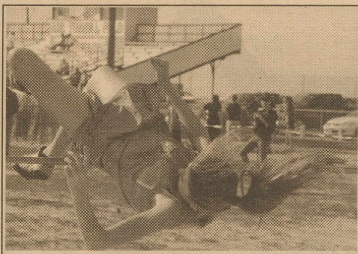
Borden County's Teryn Soto jumped a 4'8" for 1st place at the Grady Wildcan Relays. The girls and boys team's both placed 1st in the meet.