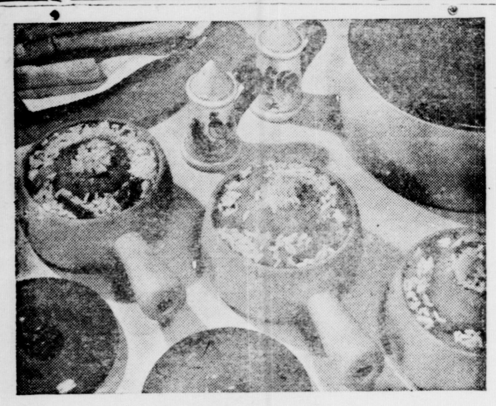
Rice Meal in a Dish

PREPARING THE FLUFFY WHITE RICE: Put 1 cup of un-