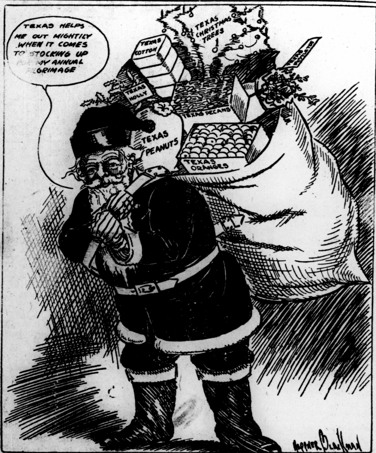
The Texas peans are finding favor among the Christmas shoppers and the nuts and fruits from the Lone Star state are popular with the northern and eastern consumers.—News Item.