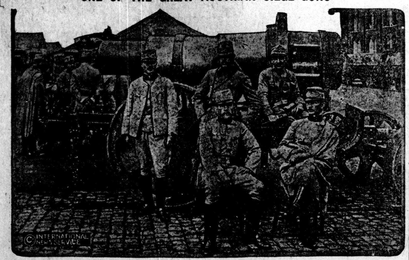
The Austrian army, as well as the German, is supplied with enormous siege guns, some of which were used in the siege of Antwerp. One of these heavy howitzers, with a group of Austrian officers, is here shown.