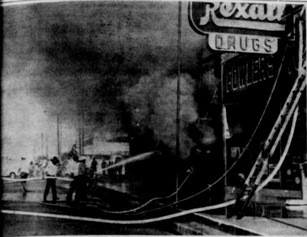
DAY FIRE —Firemen are shown battling the fire at The Country Store last Thursday. A gust of wind cleared smoke away for a moment to allow this photograph to be taken. Six fire hoses were used from two trucks to get the fire under control. The store was gutted and the building and contents lost.

WEATHER SUMMARY Memphis area received a shower Wednesday afternoon. Otherwise it has been a clear day this week. The temperature climbed to 108 one afternoon and been over 100 most days.