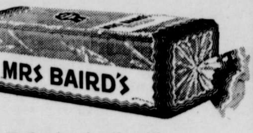
Today her family still uses that baking method... because they still care about quality.