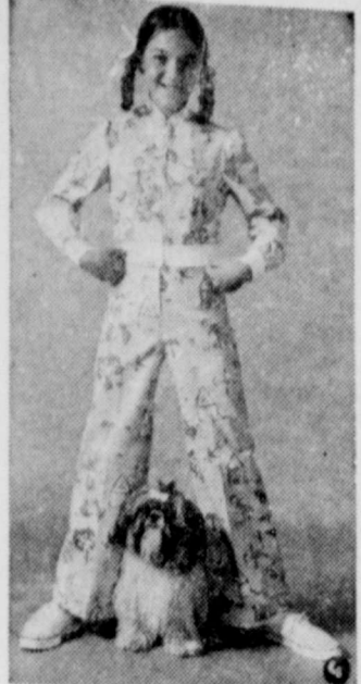
PERKY — Permanent press cotton canvas is decked out in a sunny yellow crayon print for fun and games. It's used for a zip-front warmup jacket with white knit trim, and wide-legged pants with stylish new cuffs. The outfit's a Cinderella design in Wamsutta Fabrics' canvas.

West Texas Utilities Company An Equal Opportunity Employer