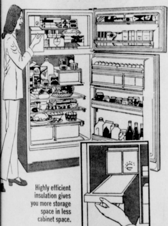
Highly efficient insulation gives you more storage space in less cabinet space.

ALWAYS PLENTY OF ICE ON HAND Automatic ice-maker fills, freezes and releases cubes into server automatically. Cube Level Control can be set to make ice enough for a couple or a crowd!