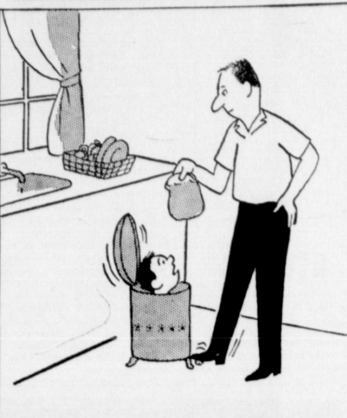
"Dad, you opened the space hatch..."