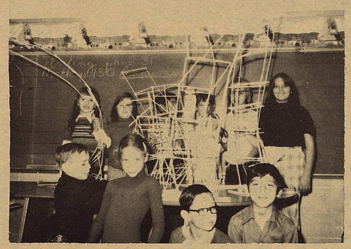
THE THIRD GRADE PROUDLY PRESENTS THEIR STRUCTURAL STUDY PROJECT