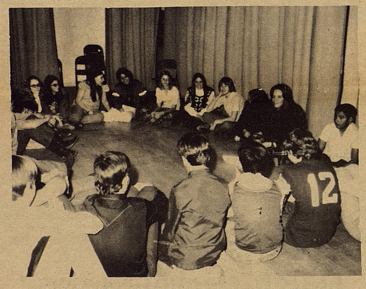
EIGHTH GRADE STUDY GROUP

The children had to develop their own method of trial-and-error techniques of problem solving on this unit. When the structure began to bend because it was too heavy, some children built another leg to balance it. Another pair of students took their structure apart and began over with a square base for better support.