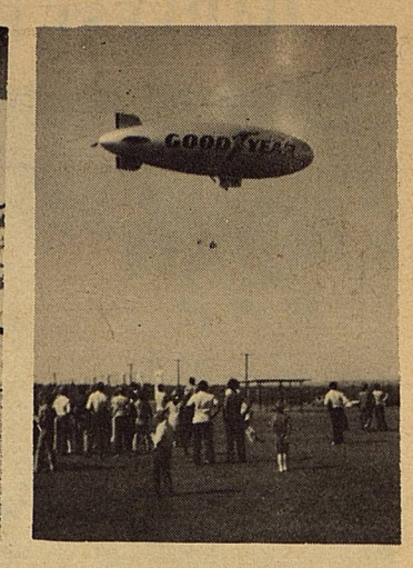
WHY IS A BLIPP CALLED A

The Chinese proverb for a man contemplating marriage goes like this: "A man should marry a woman half his age plus seven years."