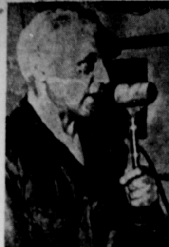
ATOMIC CLOUD DESCRIBED Dr. Karl Compton, Massachusetts Institute of Technology, discusses the atomic cloud with members of the press at Bikini atoll. He took variance with aerologists who thought they saw ice in the cloud.

EDWARDS Top & Body Shop At Moss Motor Co. 404-408 Main — Memphis