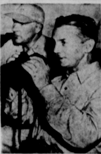
NAVY HEAD WATCHES . . . Secretary of the Navy James Forrester, right, and Vice Adm. W. H. P. Blandy, commander of joint task force, watch from the bridge of the USS Mt. McKinley as the atomic bomb goes off at Bikini atoll.