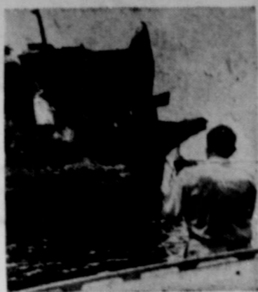
BATTERED INDEPENDENCE . . . First original photograph of damaged vessels passed review panel, shows the battered bow of the aircraft carrier U. S. S. Independence.