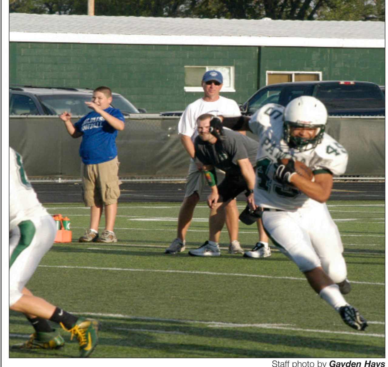
A Harvester varsity running back gains good yardage Friday evening during a scoring drive in the scrimmage against the Childress Bobcats at Harvester Stadium. The season opens against Iowa Park at 7:30 p.m. this next Friday at Harvester Stadium.