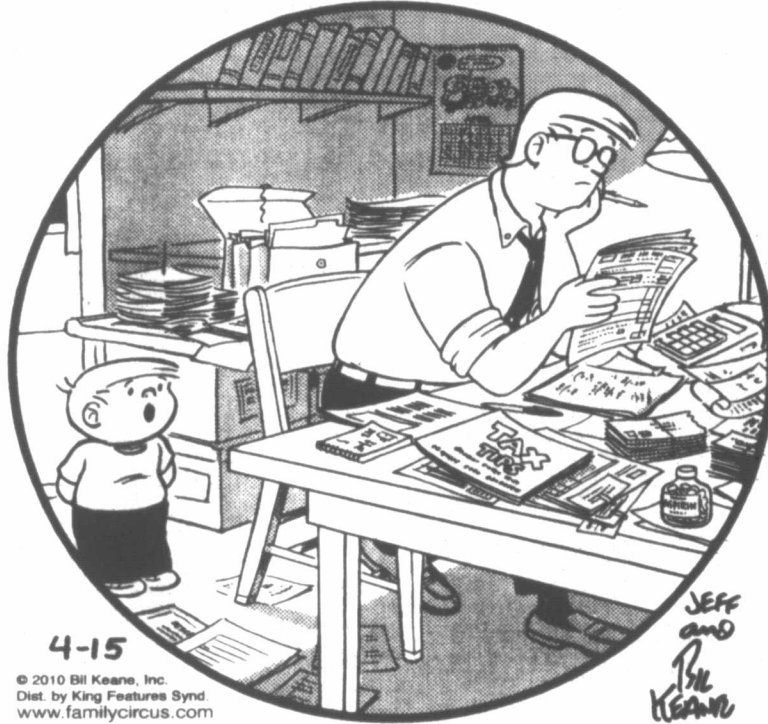
"Why did you wait till the last minute to do your homework?"