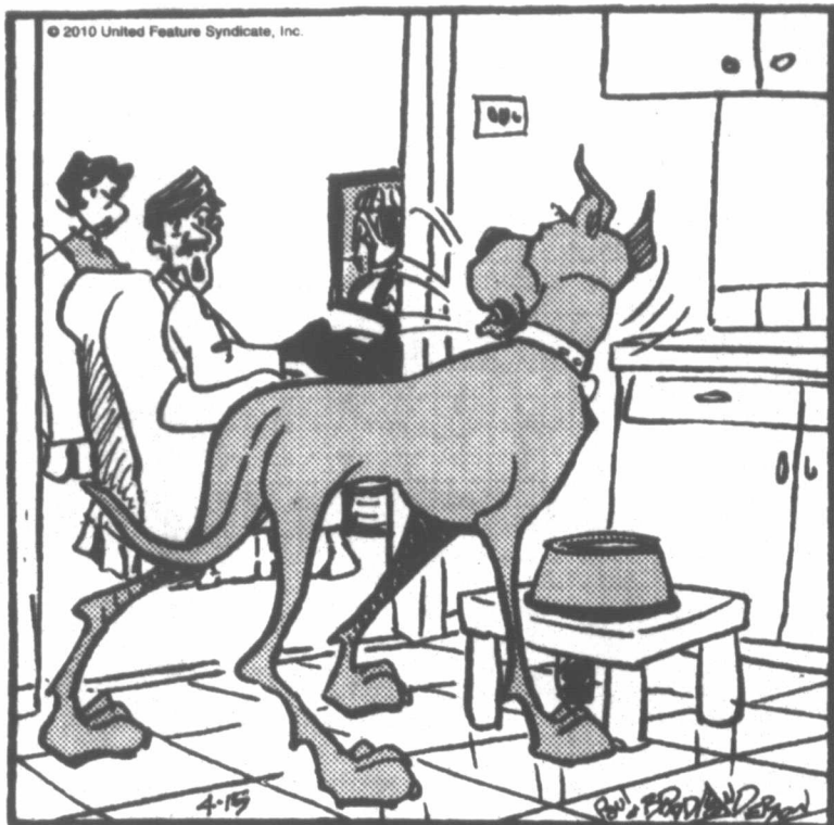
"He's never late for meals. Meals are late for him!"