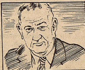
Lyndon B. Johnson was the first President to be sworn into office on an airplane.