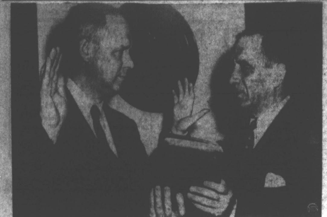
NEW-GENERAL — Charles A. Lindbergh, left, is sworn in as brigadier general in the U.S. Air Force reserve by Air Secretary Harold Talbot at the Pentagon Wednesday.

WASHINGTON, April 9 —UP— Sen. Henry M. Jackson said Friday the Senate investigating subcommittee must decide soon how much of Sen. Joseph R. McCarthy's dispute with the Army it will air in forthcoming hearings.