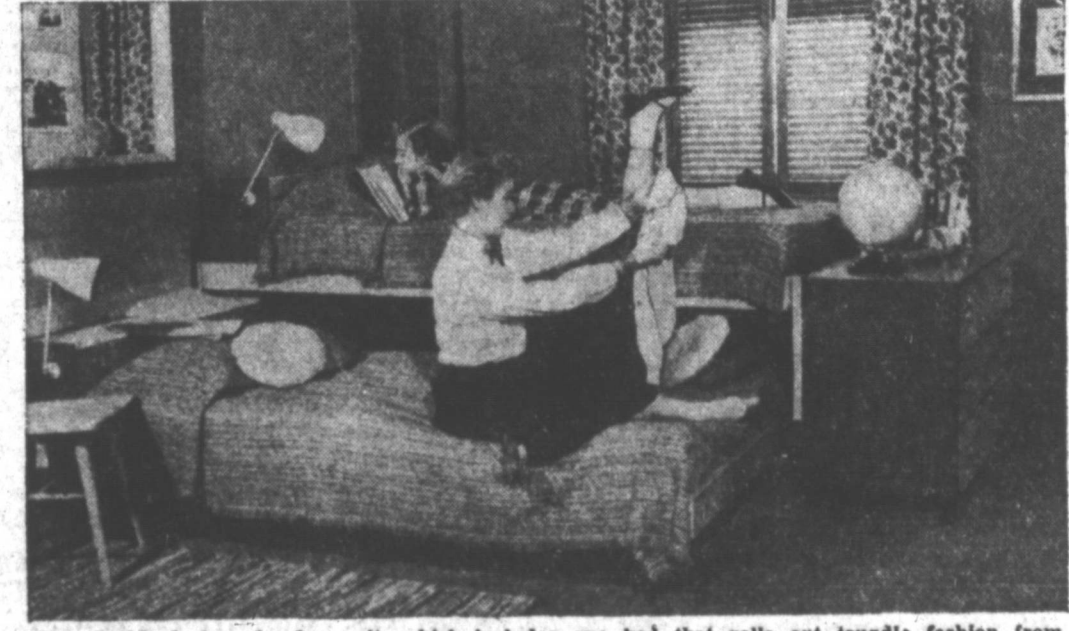
This double-decker sleeping unit, which includes one bed that rolls out trundle fashion from beneath the other, helps solve storage problem in a crowded room. Besides the three-drawer chest hooked to the footboard, each bed has a storage headboard and a built-in, swinging lamp.

If the rattle-taggle mess in the kids' room is your despair, new designs for bedrooms suggest ways to encourage neater habits. Most of the children I know (including my own) follow the path of least resistance when it comes to cleaning up their rooms. If you can make it easy for them to tidy up, make the bed and hang up clothes, there's a better chance of the job being done with a minimum of argument. Decor alone won't work miracles. Firm and frequent reminders are usually needed to spur their efforts. Easily accessible storage space rates high at tidying-up time. One new line of furniture designed for young people by Morton Goldsholl includes roomy storage boxes as headboards for beds. In a double-decker arrangement of two beds, one of which is a trundle that rolls out on big wheels, the two boxes plus a three-drawer chest hooked to the footboard pack a lot of hideaway space in a limited area. Our own solution is an under-the-window, home-made cabinet with hinged plywood doors. The inside is open space, big enough (about five feet long by two feet deep) so that all kinds and shapes of treasures can be stashed away quickly by impatient little hands. With the cabinet doors shut, the room takes on at least a semblance of order. The Goldsholl-design line, which includes quite an extensive selection of beds, chests and desks in natural maple, also has a combination bulletin board and mirror. The cork board is meant to catch