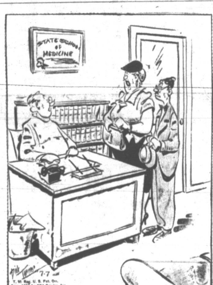
'I'm not surprised that he has two personalities-but is either of them any good?"