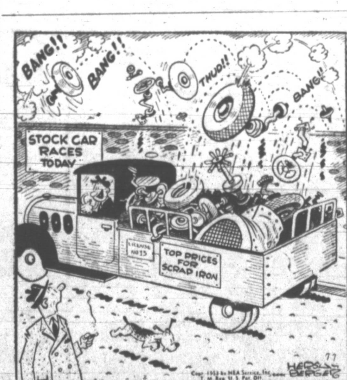
"Business is brisk when the races are on!"

next ruffed the nine of clubs in dummy, cashed the ace of learts, and ruffed a heart to return to his own hand. When South led his last club,