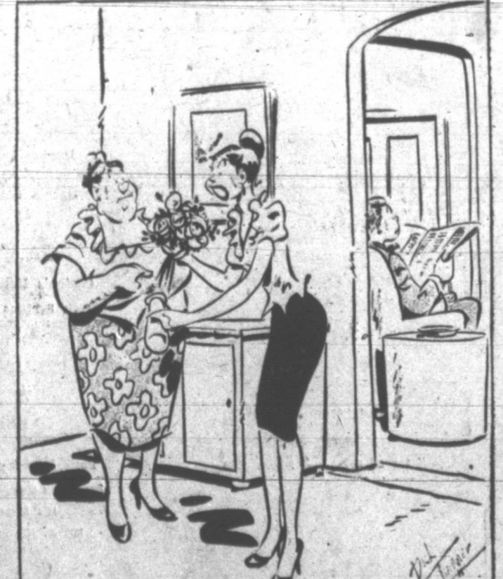
"Frankly, Alma, my husband's not going to like me spending $37.50 in a beauty parlor--and still being able to recognize me!"