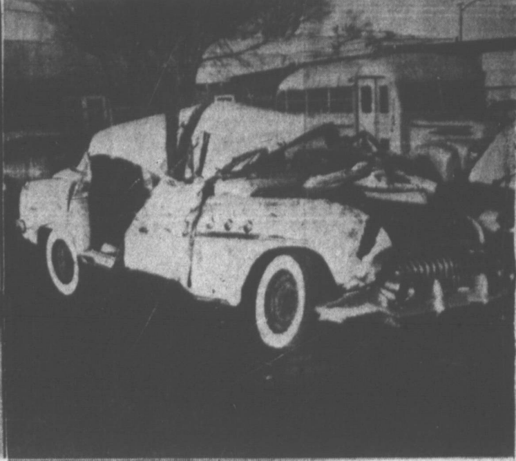
GRIM REMINDER — This death car is shown by The Pampa Daily News as a grim reminder to be careful during holiday trips this week end. Whether you plan to take in rodeos, races, picnics, go fishing, visit relatives or drive around the city block — DON'T LET THIS HAPPEN TO YOU.