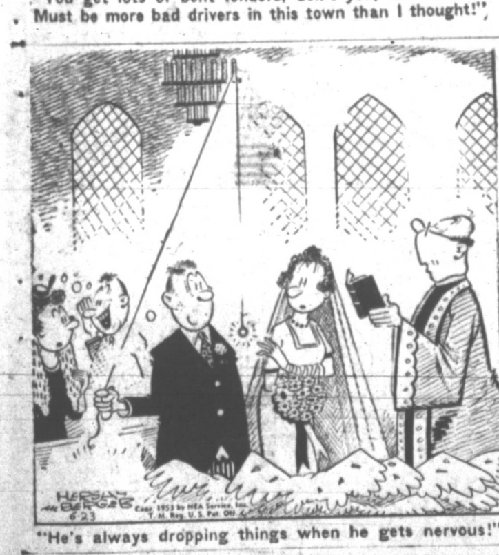
"He's always dropping things when he gets nervous!"