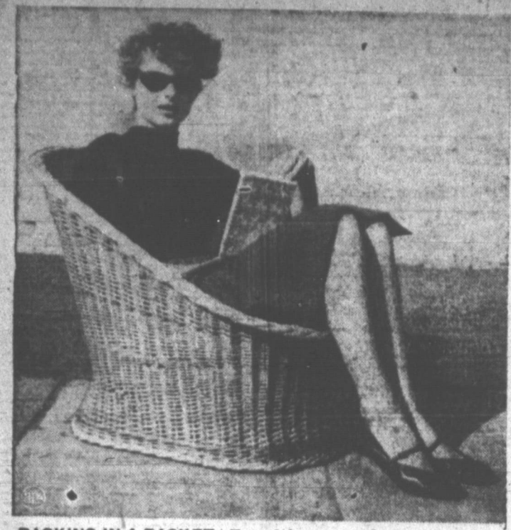
BASKING IN A BASKET—Two claims are made for this device. It can be used as a chair, as the young lady is doing, or it can be used as a basket, handy for carrying garden produce. The chair was exhibited at the International Garden Show in Hamburg, Germany.