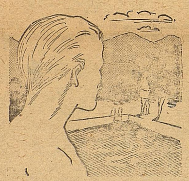
His features were set as he gazed across the pool at the girl and man.

He had worked it to sit with them, the day everyone took the