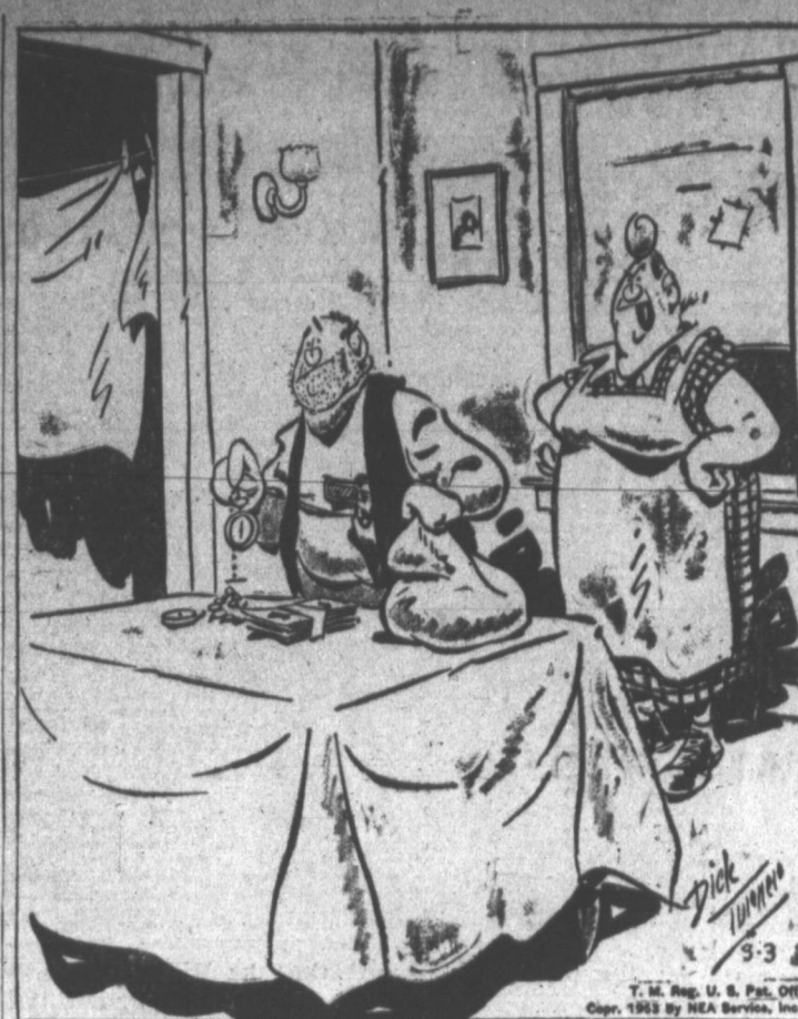
"It's time we started planning for the future—how about putting some of that away for bail money?"

divisions, giving Kai-shek on Formosa a navy and a jet air force, maybe blockading Chi air force, maybe blockading China and trying to end the Indo-China war. So what may come out here instead of a reduction in foreign aid, is a request for more of the same. The Truman-prepared budget for next year allowed $7.8 billion for all foreign aid. About $2 billion of this was to be economic aid for military support, the rest, straight arms aid. The $2 billion for economic aid is vulnerable. MSA has about $4 billion in unobligated funds. In the normal course of its business, all this money might be obligated by June 30. But these unobligated balances are per targets of the congressional economists. And here would be an opportunity for the Congress to order that these funds be used to liquidate the economic aid program. MSA Administrator Harold Stassen now has 11 teams of five business men each surveying the foreign aid programs in various parts of the world. They won't report for another month. Their recommendations may have some weight in deciding the future of American foreign aid programs — if the Congress will pay any attention to them. Meantime, of course, Appropriations Committee Chairman Sen. Styles Bridges and Rep. John