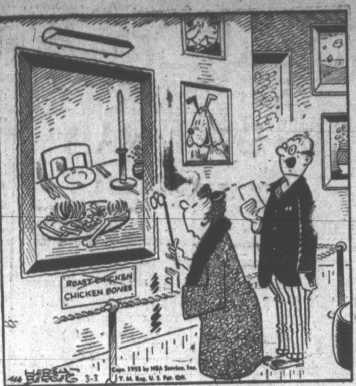
"The artist got hungry—and changed the title!"