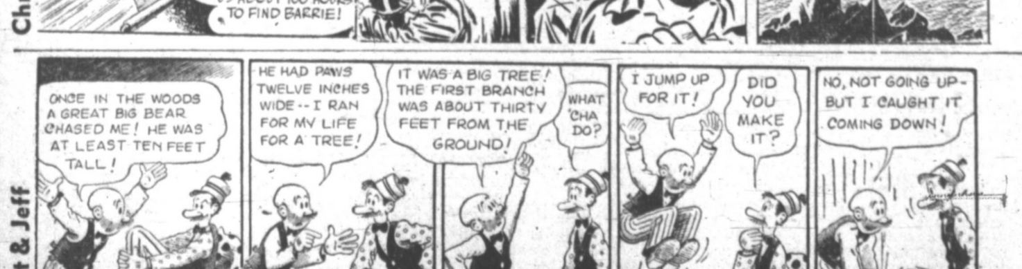
Mutt & Jeff