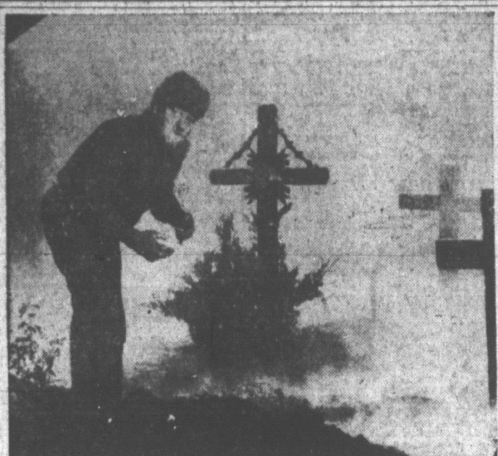
SEE... WOLF MAN IN CHAN LOO & CO. "HORRORS OF THE ORIENT" - LANORA THEATRE - Friday Night, Feb. 6th - 11:30 p.m. On the Screen - "CAT PEOPLE"