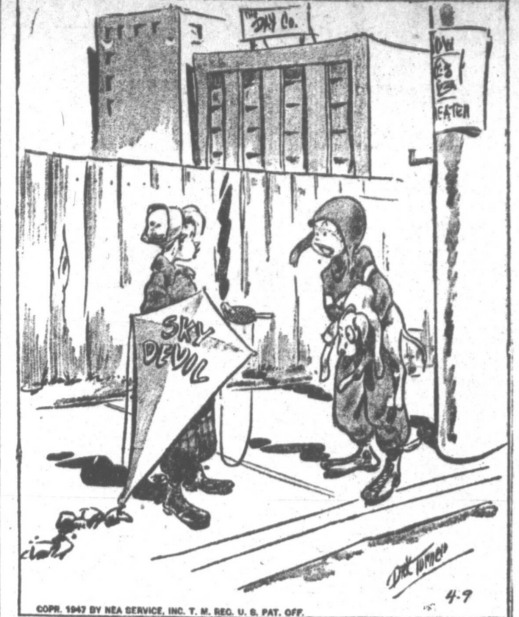
"My allowance is up into three figures now—Pop raised it to a dollar!"