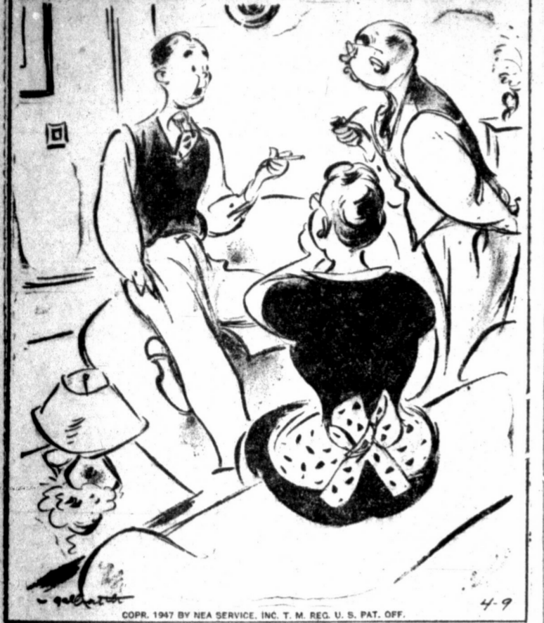
"Besides, if I get married, I'll have a chance to save money—I won't have to be paying five dollars a week board!"