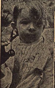
... becomes cute little boy after hair- cut.