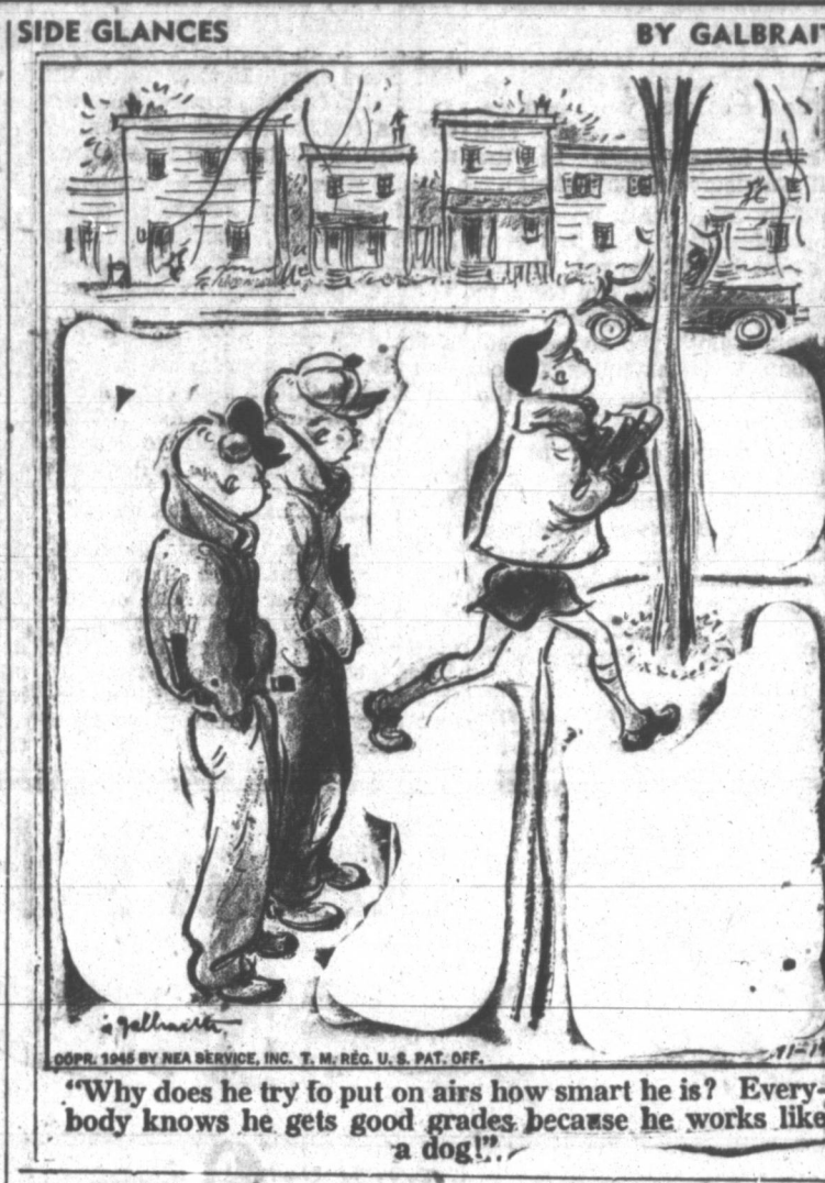
Why does he try to put on airs how smart he is? Everybody knows he gets good grades because he works like a dog!

46-A-Wanted To Buy WANTED TO BUY: Welding machine and used welding equipment of all kinds. 323 Roberts.