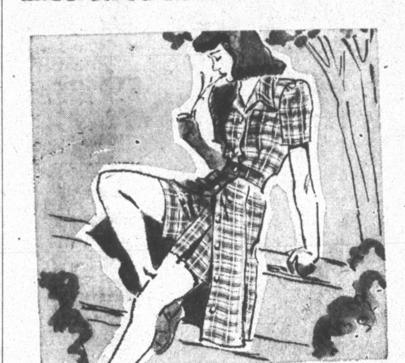
IT'S A PLAYSUIT! AND IT LOOKS LIKE A DRESS! 4.98

See, it's shorts and shirt with a smooth fitting skirt over them! The slim shorts and smart shirt are ideal for sports, and then you just put on the skirt and go right into town—or to dinner! Where to find it? At Wards, of course! We've cotton plaids, prints, stripes—in flattering styles! Don't miss them! You'll find them in Wards complete Sportswear Department! 12-18.