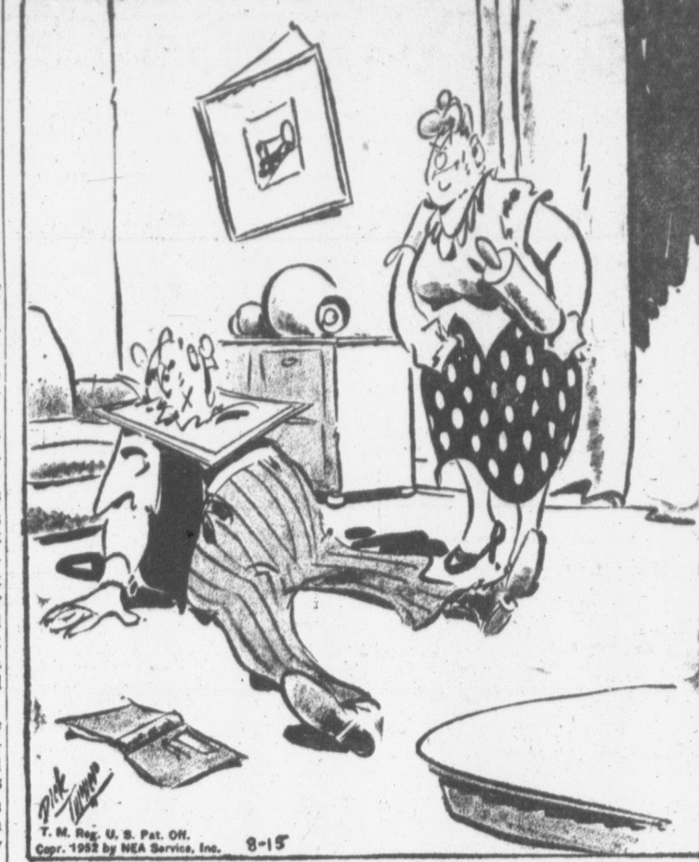
"But this is ridiculous, pet! Why should we quarrel over anything so trivial as your mother?"

No further action is contemplat- the special care of the state. Western Reserve Life Insurance ed.