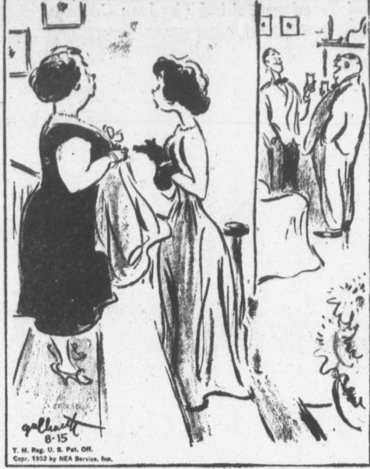
"Dad's joking all the time-how did you know he was in earnest when he proposed to you?"