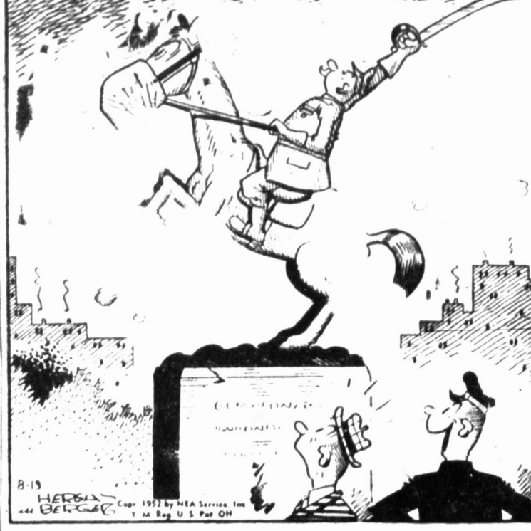
"Some women's guild or other insisted on fastening on a feedbag!"