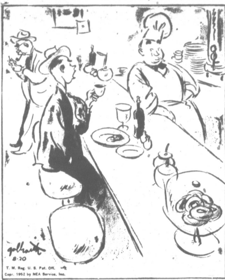
T. M. Reg. U. S. Pat. Off. Inc.