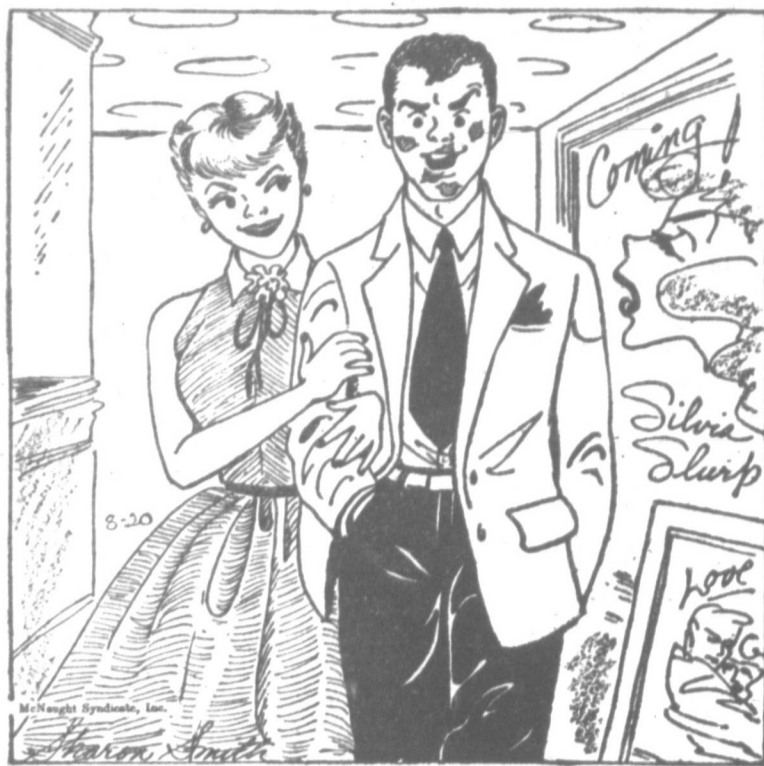
"Boy! What a mimsy movie!"