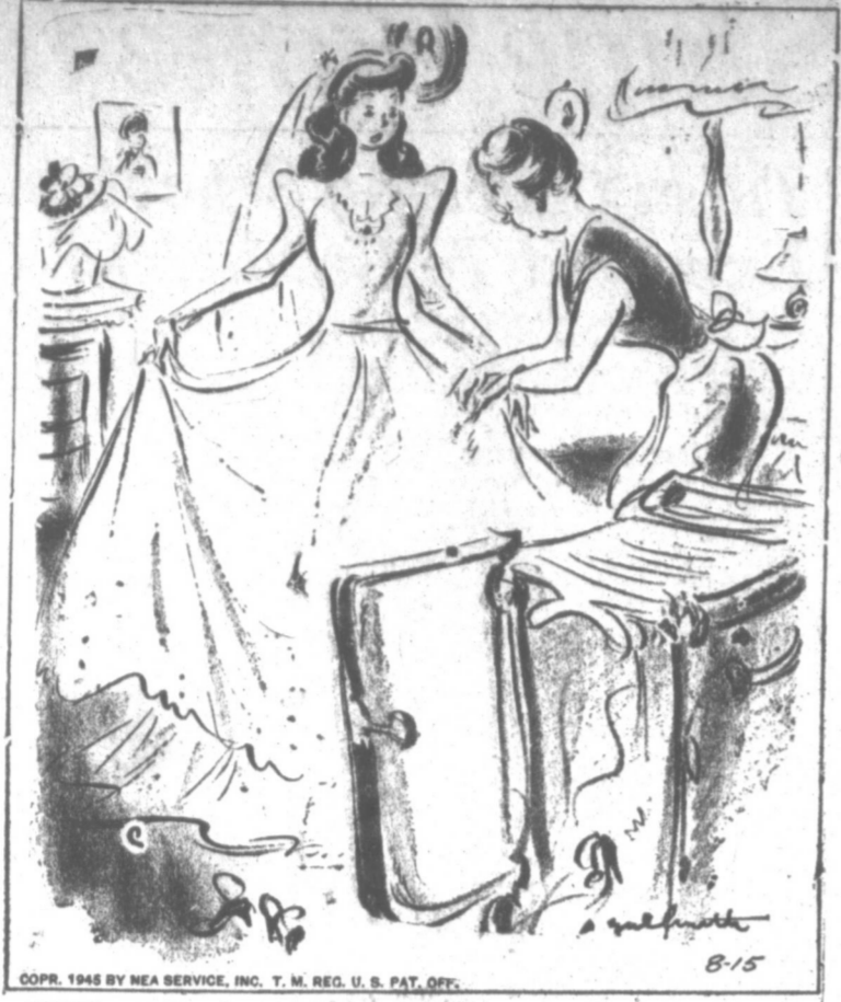
"Bill's a nice boy, but remember, if you should have a little quarrel, call me up right away—I wish he weren't so used to shouting Jans!"