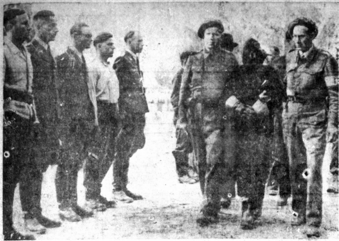
An informer, completely masked as a protection against Nazi reprisals, aids Allied intelligence troops at Oslo, Norway, above, during search for Gestapo agents hidden among German soldiers.