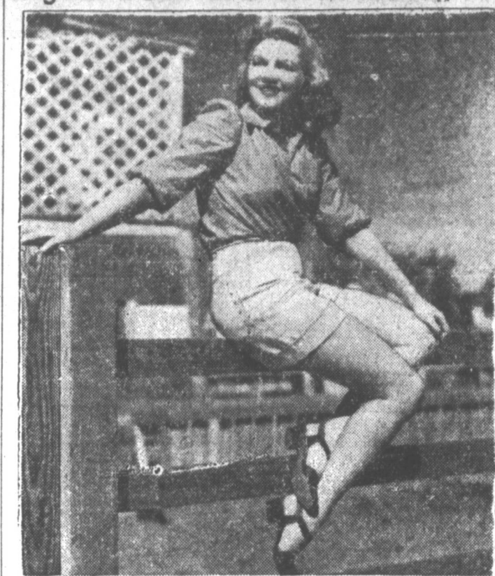
CLAIRE TREVOR: Leg art is her specialty.