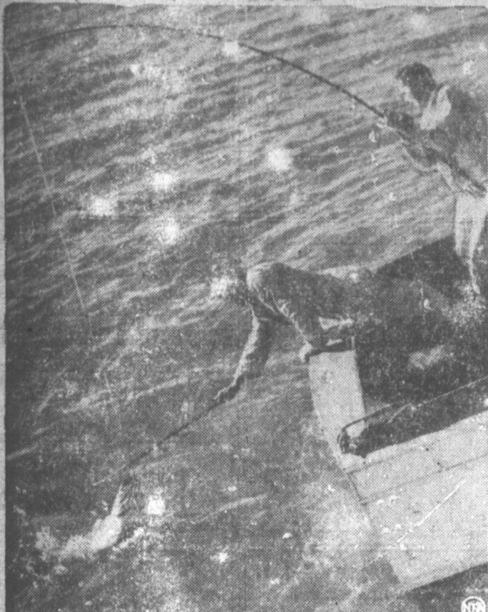
As Coast Guard partially lifts restrictions against outside sport fishing on Atlantic coast, fishermen once more head boats through inlets in search of big tuna. Here a large channel boat is being boated near Oregon Inlet, North Carolina.