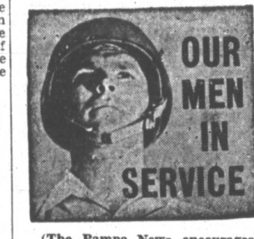
OUR MEN IN SERVICE

WASHINGTON, Aug. 28.—The army has decided to divide equally among five parties the time allotted for shortwave broadcasting of politics to troops overseas, without regard to the question of whether President Roosevelt's speeches will be considered political.