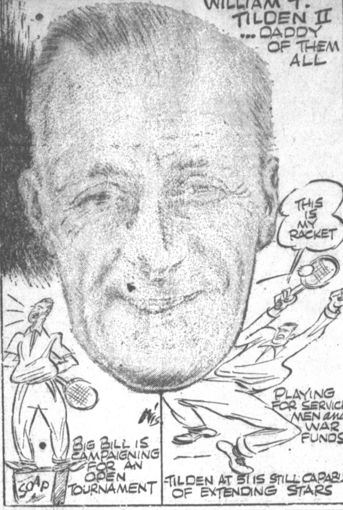
TILDEN AT 51 IS STILL CAPABLE OF EXTENDING STARS