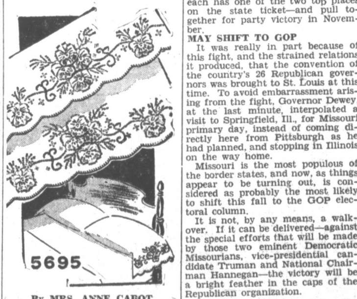
By MRS. ANNE CABOT Colorful big pansies—three inches across—done in shades of purple, lavender, pale yellow and a touch of lipstick red make stunning designs on thousau linen pillowcases, hand towels or on pale green, lavender or yellow tea cloths.