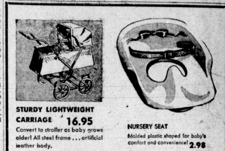
STURDY LIGHTWEIGHT CARRIAGE 16.95 Convert to stroller as baby grows older! All steel frame... artificial leather body.

"Yes, sir. The Major smiled in the darkness. The magic name could still invoke awe."