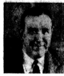
CHESTER BOWLES, Administrator, Office of Price Administration

"Behind this plan, effective December 13th, is one of our country's most urgent wartime needs," says Mr. Bowles. "Every patriotic American wife and mother is asked to read this statement."