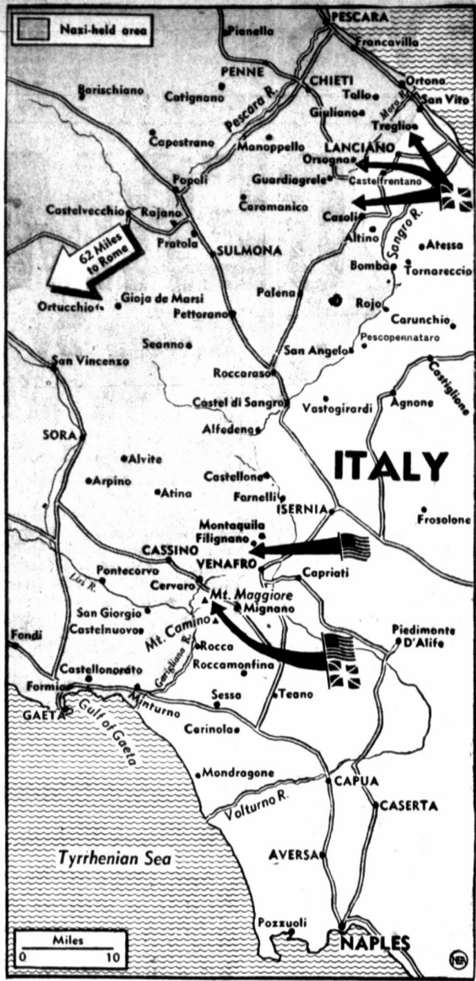
In a battle comparable to Verdun, American troops under Gen. Mark Clark have stormed Mt. Maggio and Mt. Camino, capturing several strategic heights. To the east, British forces, thrown back at Orsogna, surged forward to establish a five-mile front along the Moro river.