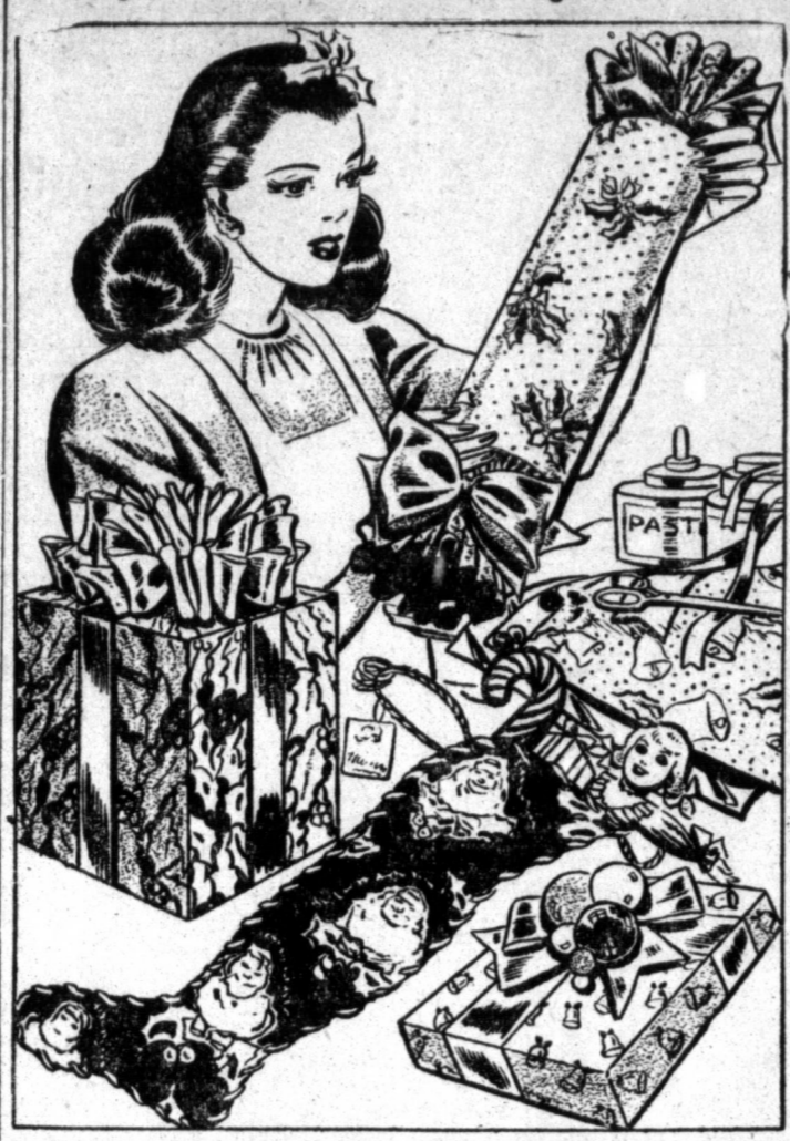
Gay wrappings make Christmas gifts twice as welcome, so why not try your hand at concocting your own original packages and novelty trimmings this year.