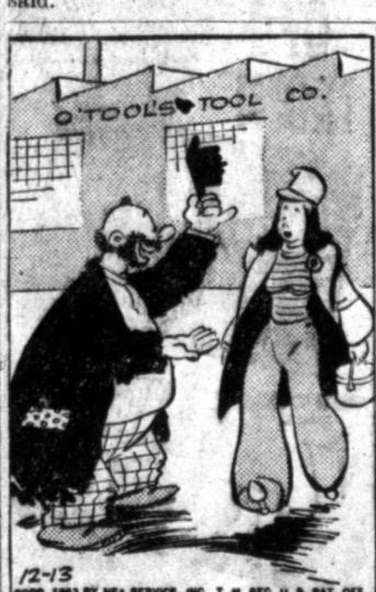
"Mind if I turn it to the wall until I finish?"