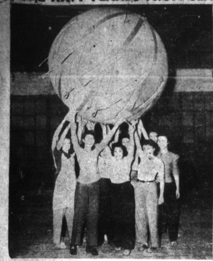
Navy planes shot down over the ocean, may be raised to fly and fight again under a plan worked out by Navy engineers. Each balloon will lift three tons and as many as five or six of them may be attached to the heavier type planes. The balloon pictured above will lift five times the weight of the girls shown holding it up. Manufactured by The General Tire & Rubber Company, the first order is nearing completion and if tests are satisfactory, it is expected that hundreds of these balloons will be built for Navy use.