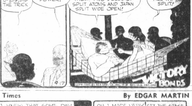
Like Old Times DU'D FIND THE RIGHT