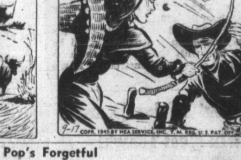
RECKLES AND HIS FRIENDS

Those little kids depend on dots of milk, fruit, and Wheates, "Breakfast of Champions." And that's for you, too Satisfying nourishment in those whole are "second helping" good.