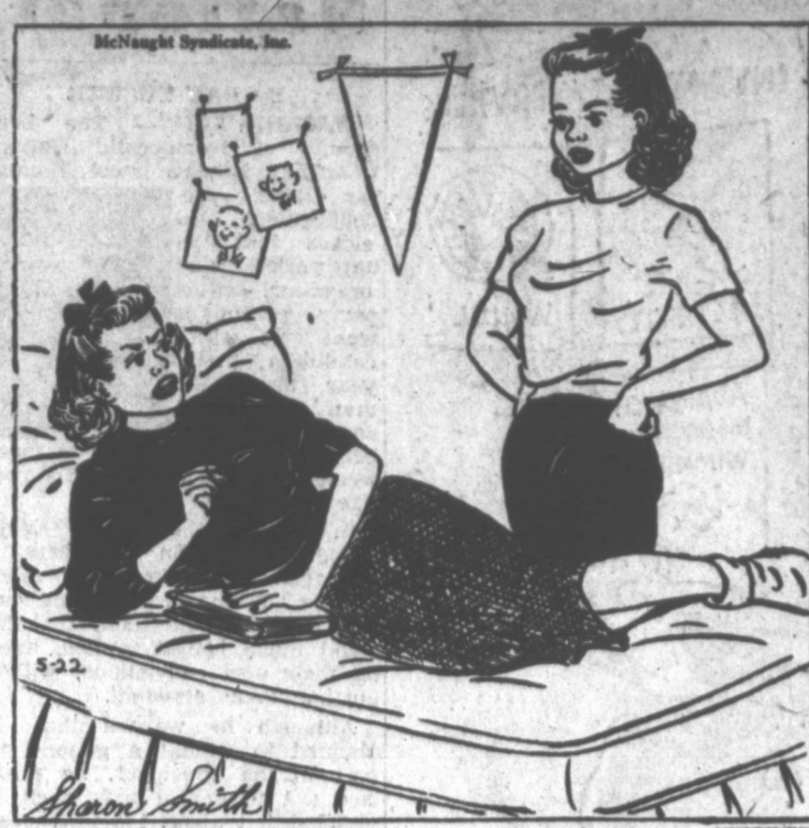
"The only time you ask to borrow something is when you can't find it!"