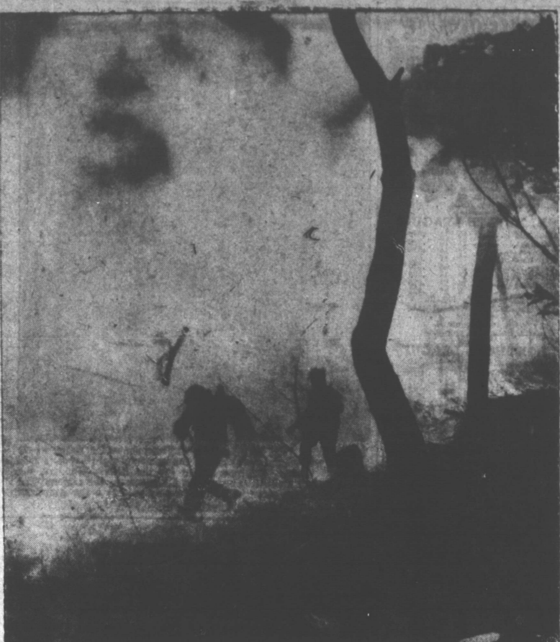
THROUGH SMOKE OF BATTLE —U. S. First Marine Division fighters dash through a smoky battle ground to take cover during hot fighting in Korea. A Marine combat photographer took this dramatic picture of men at war.

Two women and a man were fined $25 each in corporation court Monday on charges of vagrancy. At the same time, a local woman and two men received fines totaling $40. One man charged with disturbing the peace was fined $15 in that court.