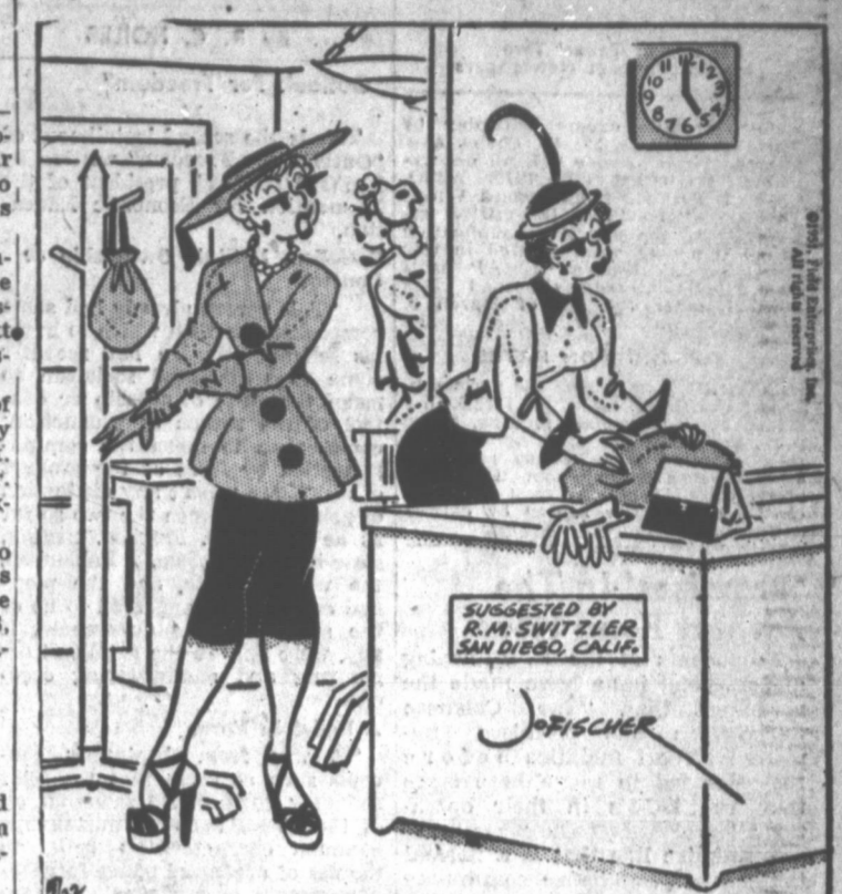
The next time I come to the office I'll stay home... then I won't have to go back.

BOYS! There's still time to enter the Soap Box Derby!