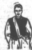
Pay him the FIRST time he calls!

Plus, swift delivery of this exciting daily news-package by a young businessman whose dependable service adds much to your reading pleasure.