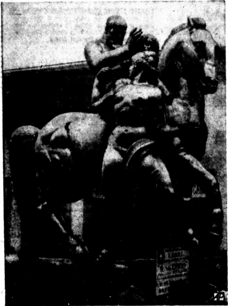
FROM ITALY TO THE U.S.—One of four bronze monumental groups, gilded with gold donated by Italian people, is displayed in Florence prior to its shipment to the U. S. where it will be placed on the Arlington Bridge at Washington, D. C.