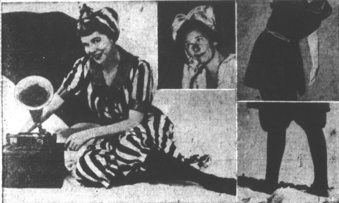
It's the turn of the century, and taking a look at the bathing suits of that era, is it any wonder the century turned? With her covered-up look, it's a good thing grandpa had imagination. If it wasn't for the come-hither look in this "swimmer's" eyes, she could be a he. Just for curiosity, let's analyze a 1900 beach costume item by item: At left, is a vintage-somehow-around-1900-bathing-cap. How did this job keep the hair dry? It didn't have to—the girls seldom went in the water. Next is the main part of the suit. It had the sleek, feminine lines of a taxicab. This is high fashion around 1900—but it looks more like low comedy. Below are legs, clad in the 1900-type bloomers and black stockings. At the bottom of the legs were usually sandals. At the top was a girl.