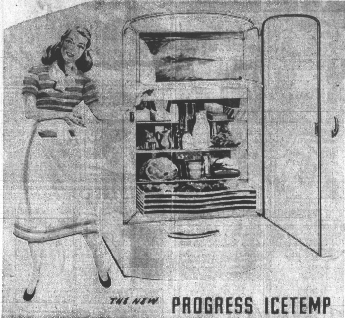
THE NEW PROGRESS ICETEMP

This is it! It's modern, it's beautiful, it's efficient, it's the new Progress Ice Chest Refrigerator. A new refrigerator offering the latest in efficient refrigeration for the home. Uses ice in either the conventional block form or the new convenient easy way to use sized ice. And Ice Chest's ice chamber door prevents the spilling of any ice regardless of which type is used; also avoids exposing ice while removing food. See Pampa Ice Company for particulars, today.