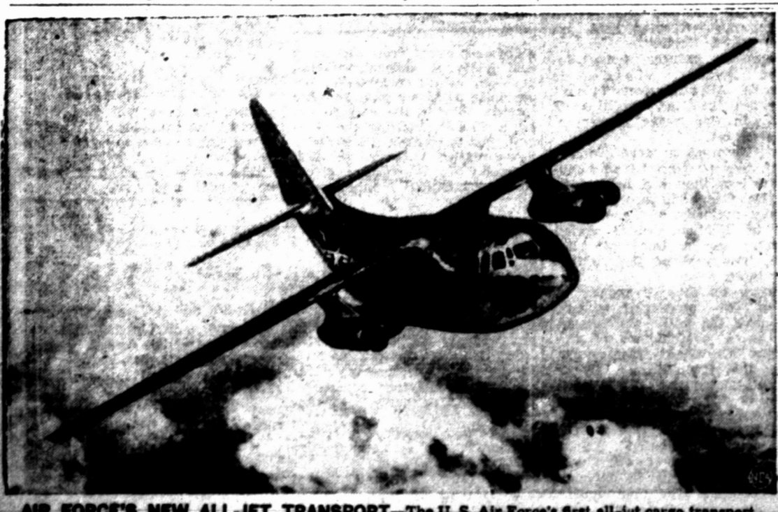
AIR FORCE'S NEW ALL-JET TRANSPORT—The U. S. Air Force's first all-jet cargo transport, the C-119, is shown in a test flight near West Trenton, N. J. A sister ship of the conventional C-119 transport, the four-jet plane can carry freight or 60 combat troops, or 50 patients.