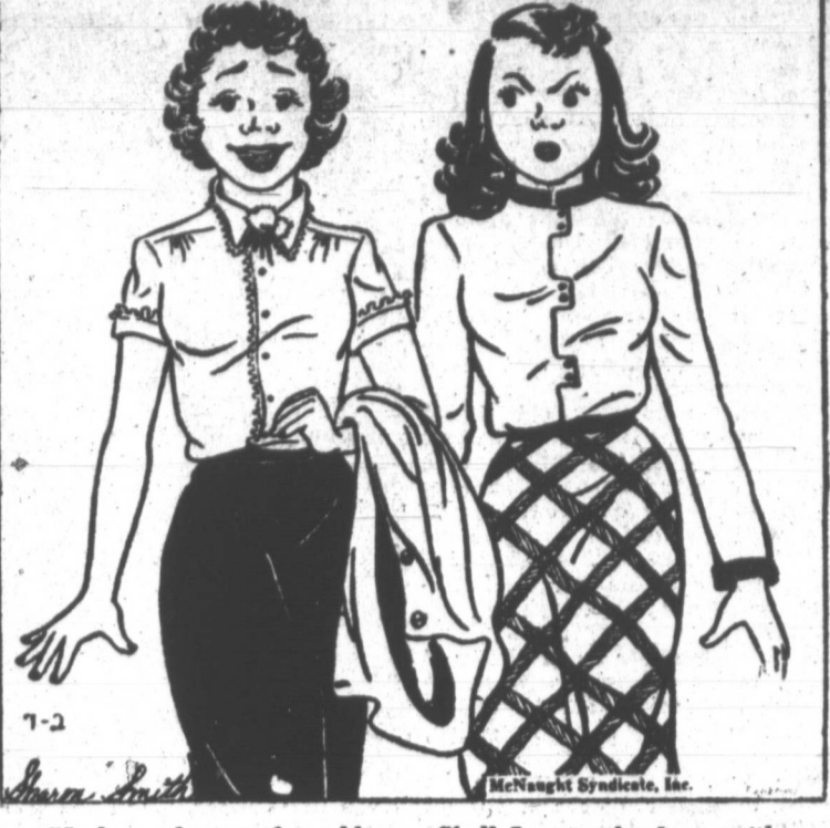
"I always have such problems—Shall I go to the dance with Fred or Joe, and if I go steady with Bill I suppose I'll have to give Chuck's ring back—oh, dear"