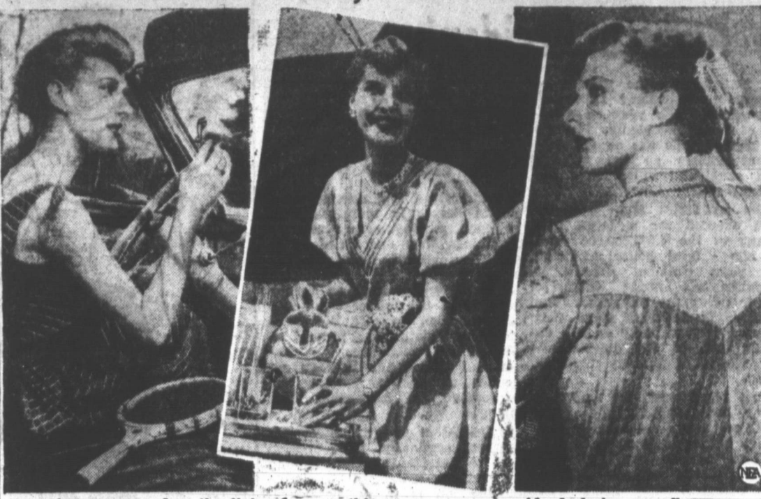
Even in summer, when the living is easy, this young woman avoids declaring an off-season on beauty. Elaborate make-up and hair-care routines are shelved until fall, but quick and easy essentials are retained. Casual, outdoor girl gives her lashes a last-minute upstroke before joining her date for tennis (left). Good-looks aids are her colorful sunback dress and her carefree but attractive hair-do, which requires only a quick wash with a brush to arrange (right). Although terrace suppers replace indoor dinners, she is careful to look her best despite informality of occasion (center).