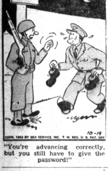
"You're advancing correctly, but you still have to give the password!"