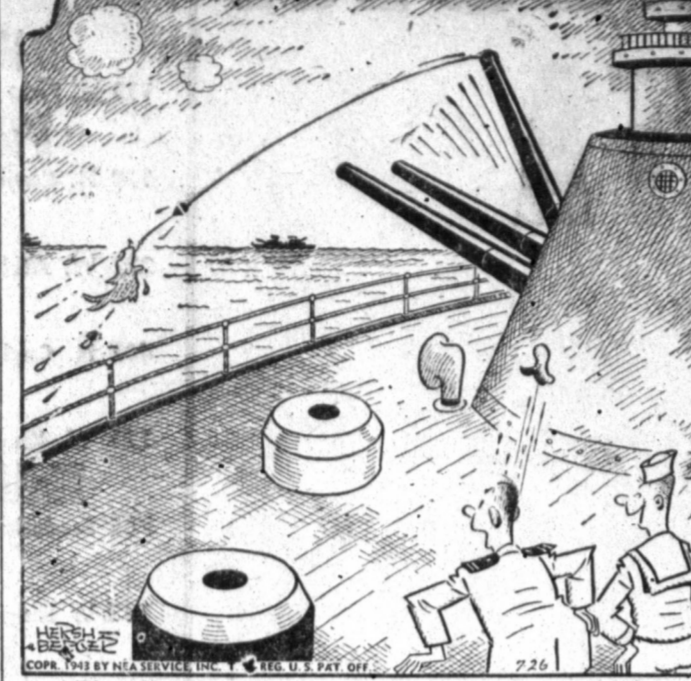
That Number One gunner is fishing again, sir!