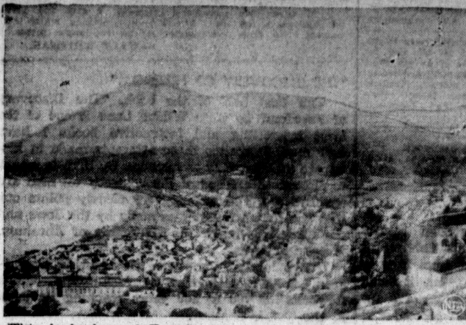
This is harbor of Termini-Imerse on northern coast of Sicily, where U. S.-British bombs have fallen in rain of death which has helped in a big way to dampen Mussolini's spirits.