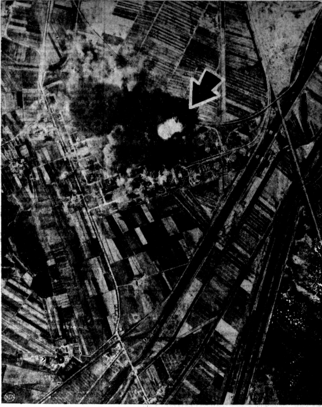
Black smoke and flames mark a direct hit on the Leghorn target after Flying Fortress dropped its stick of bombs. Bombardier aimed not at oil tanks to right of arrow, but at the cracking and refining plant enveloped by the blast, thus destroying a source of Italian oil production.