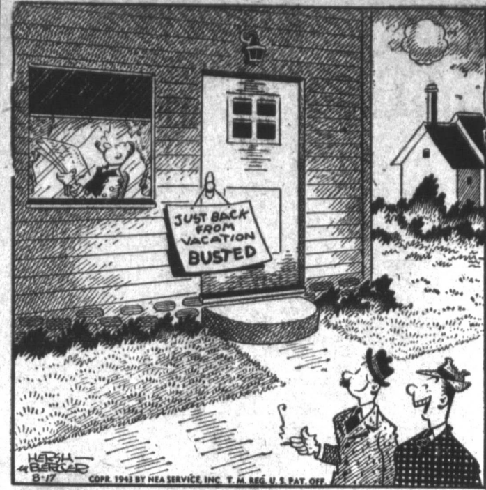
"He won't be bothered now with salesmen and bill collectors till next month!"