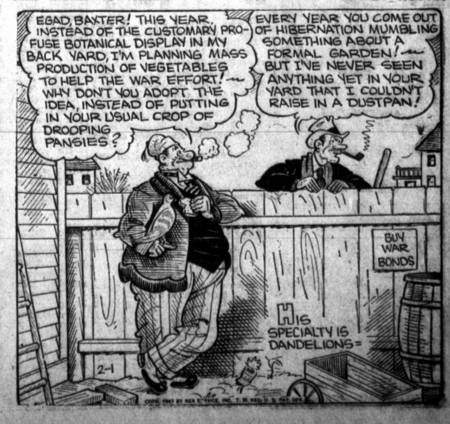
with - - - - MAJOR HOOPLE