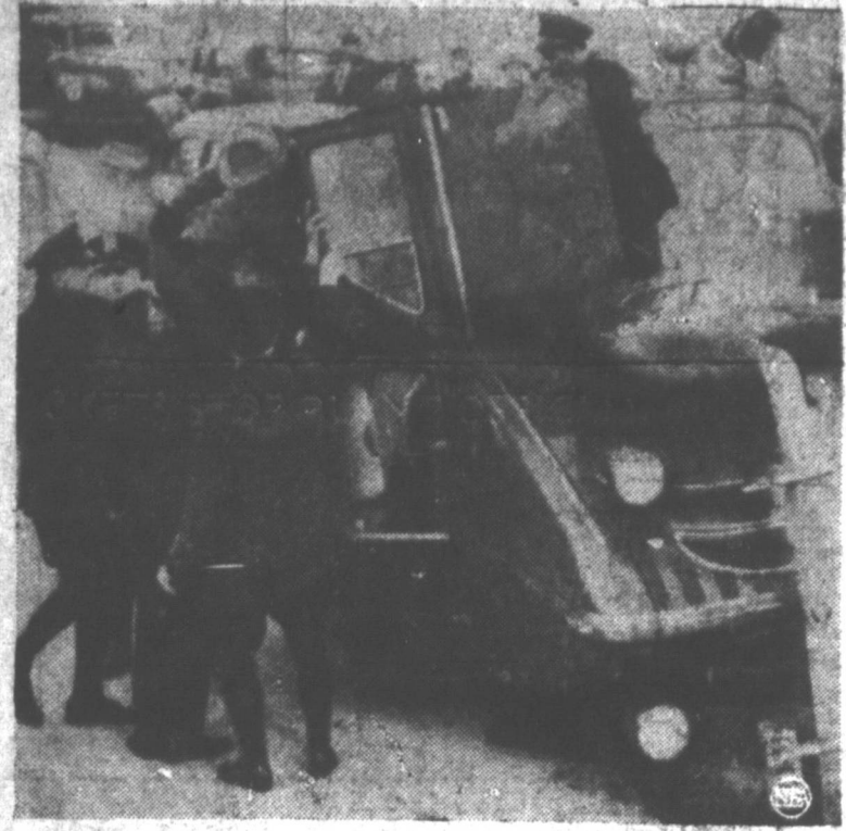
Police assist a plant official out a door of an overturned car after pickets at General Motors Diesel plant in La Grange Ill., dumped it over when the driver refused to show badge and insisted on going through the picket line.