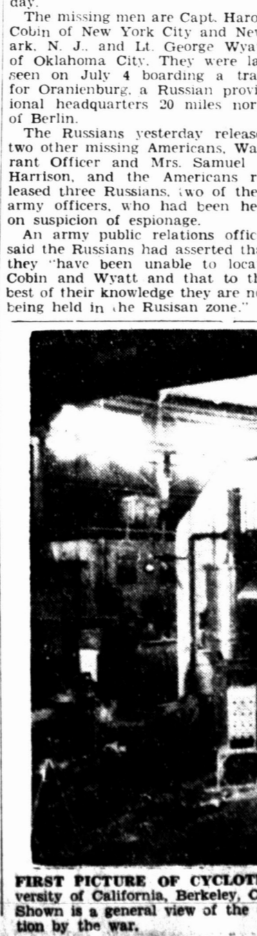
FIRST PICTURE OF CYCLOTRON—War-time secrecy stripped from the 184-inch cyclotron at the University of California, Berkeley, Calif., photographers are allowed to shoot the machine for the first time. Shown is a general view of the cyclotron, begun in 1945, and now in process of completion after interruption by the war.